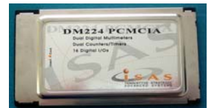
DM224 6 1/2 Digit DMM