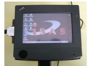
Software & Integration Services

Innovative Strategic Advanced Systems, LLC 3701 Canal St. Suite M New Orleans, LA 70119 www.isasco.com E-mail: Sales@isasco.com 504-486-2500