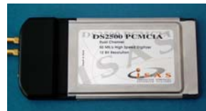
DS2500 Scope Card

ISAS develops applications using a wide range of software languages and tools including C++, Visual Basic, NI Labview and Java. Our services include GUI design, test automation, test fixtures, test cabling and test data analysis. We have experience in a variety of operating systems including Window 98/2000/XP, Embedded XP, Window CE.net, Linux, and imbedded Linux with real time extensions.